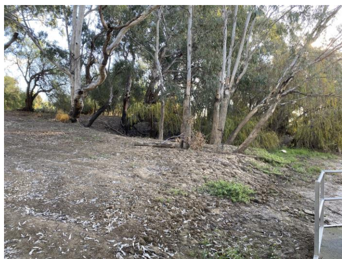
Figure 5 Site of the boating facility