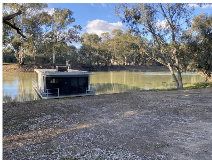
Figure 4 Site of the boating facility

The immediate area of the mooring contains either native vegetation or is the River Murray.