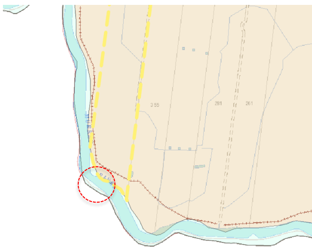
Figure 1 Zone map

In accordance with the Wakool LEP zoning maps the land is contained within zone W1 Zone – Waterways.