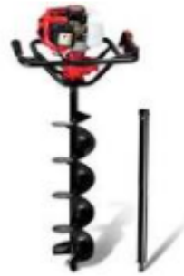
Giantz 92CC Petrol Post Hole Digger...

Trench 0.75m below ground level using petrol post hole digger (refer to figure: 1) at the proposed locations as shown on the plans, followed by installation of pine post material mooring pole to anchor the pontoon boat.