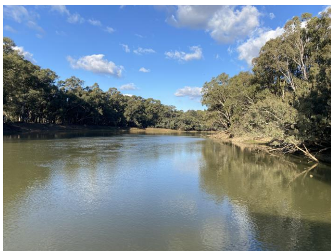
Figure 7 View south-east of the proposed mooring