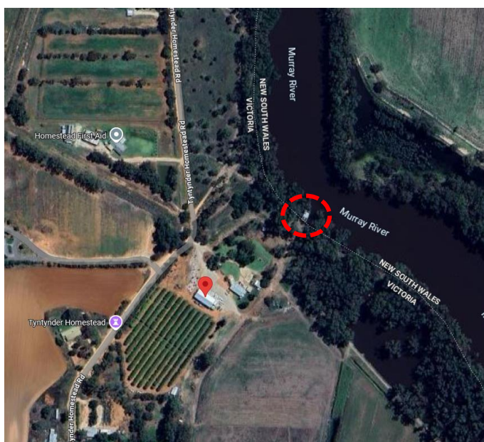
Figure 3 Aerial image of the site